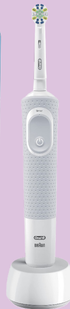
Oral-B Vitality FlossAction Electric Rechargeable Toothbrush