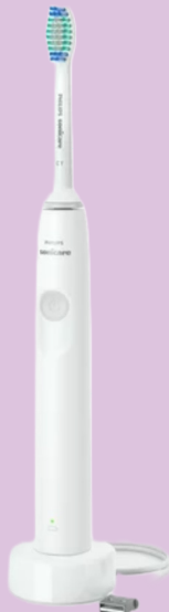
Philips Sonicare 1100 Rechargeable Electric Toothbrush